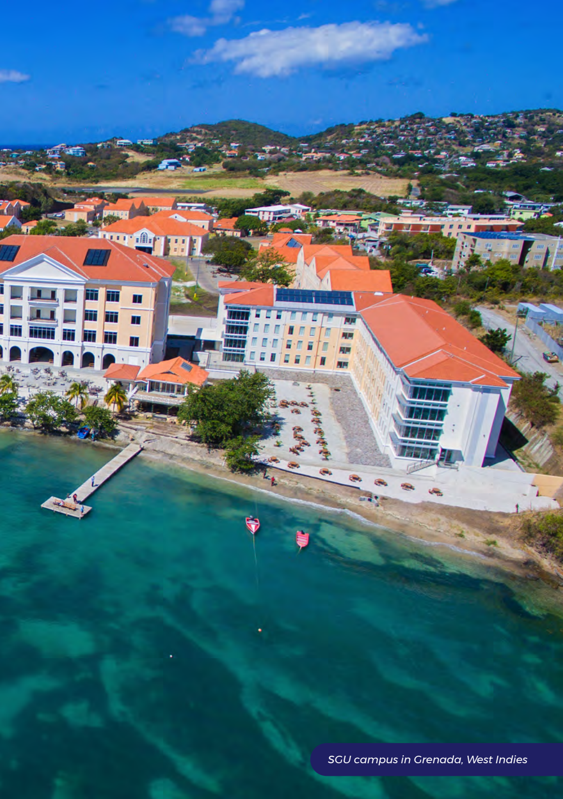
SGU campus in Grenada, West Indies