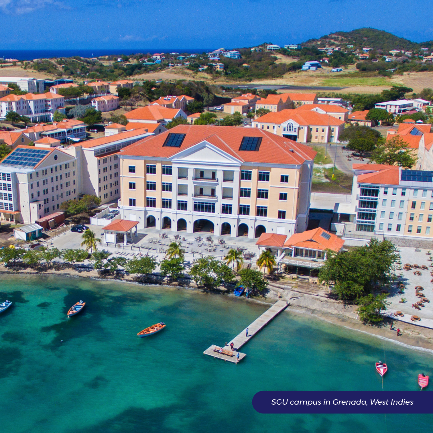
SGU campus in Grenada, West Indies