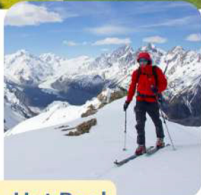
Ski Lesson, Hot Pool Jet Boat & Antarctic Centre