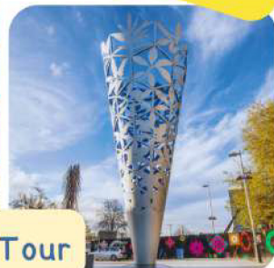
Christchurch City Tour