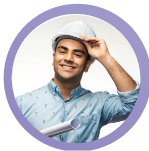
SAFETY AND ENVIRONMENTAL MANAGEMENT