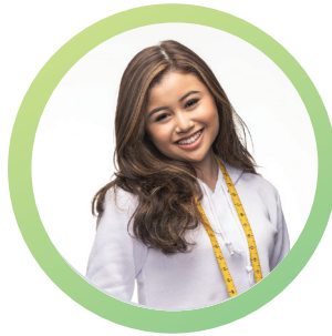
FASHION AND DESIGN