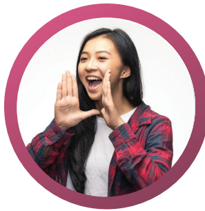
LANGUAGES AND EDUCATION