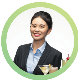
TOURISM AND HOSPITALITY