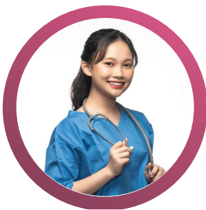
HEALTH AND NURSING