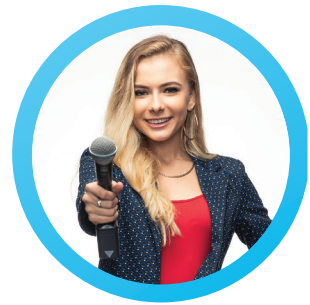
MEDIA AND COMMUNICATIONS