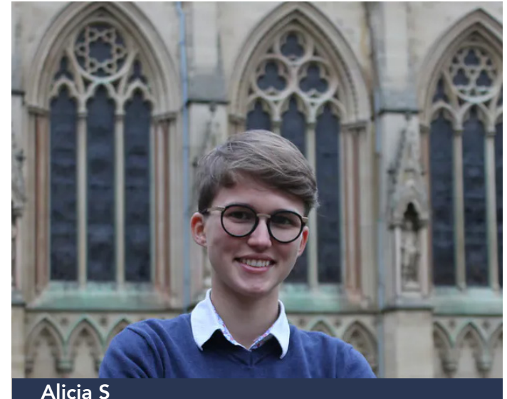
Grade: A*A*A*A - Natural Science UNIVERSITY OF CAMBRIDGE