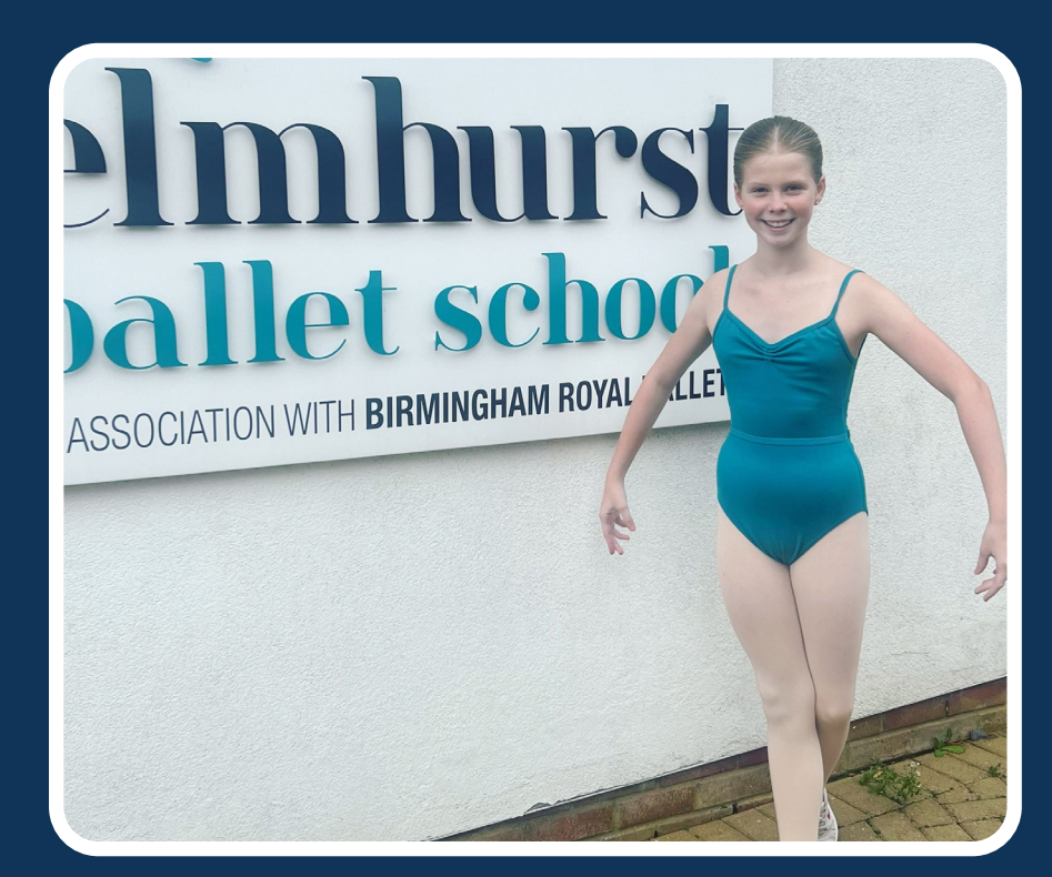
Scarlett B British Ballet Organisation